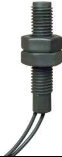
MAGNETIC KILL SWITCH

ALWAYS DISCONNECT THE MAGNETIC KILL SWITCH FROM THE DISPLAY BOARD BEFORE YOU BEGIN TO THREAD IT INTO OR OUT OF ITS MOUNTING HOLE ON THE DISPLAY PANEL.